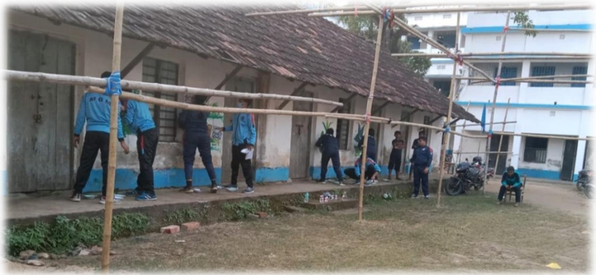
Drawing Relay contest