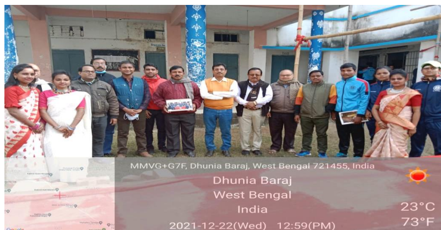
A token of love to the Camp Site Provider