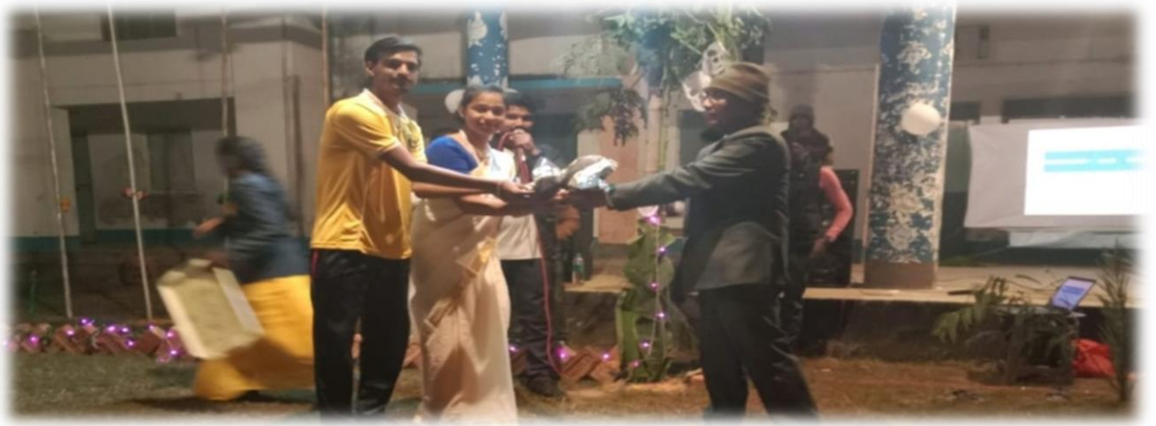
Champion House - 2021